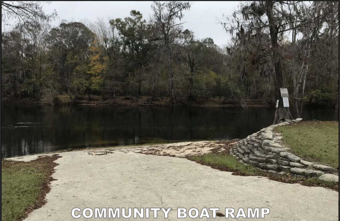
COMMUNITY BOAT RAMP