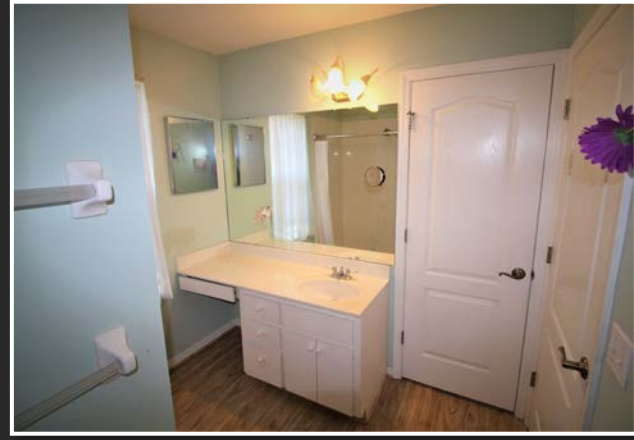
Tarpon Realty, its members, and/or agents make no guarantees, representations, or warranties of any kind, expressed or implied, regarding the accuracy or completeness of any of the information herein provided. All information, regardless of source, should be personally and/or independently verified by the recipient.